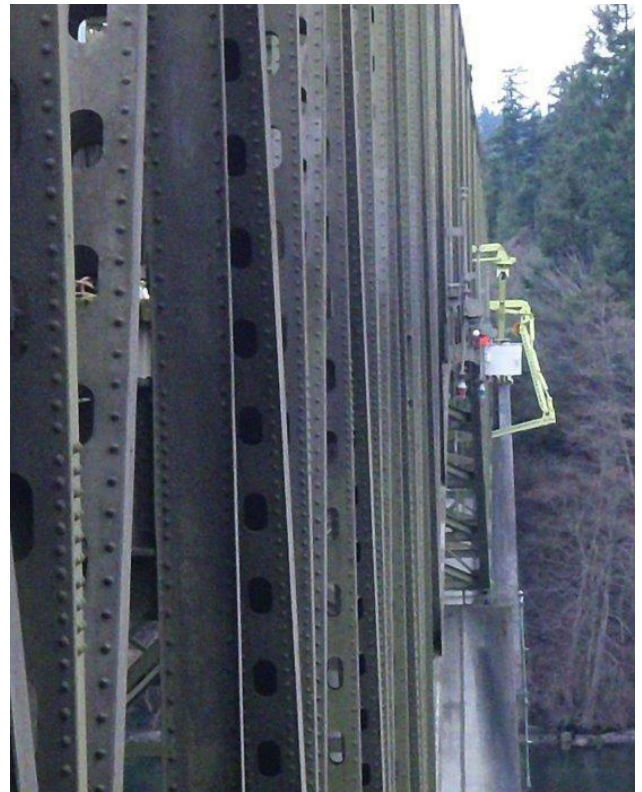
Crews will use Under-Bridge-Inspection Trucks (UBITs) to clean, inspect and maintain the Agate Pass Bridge in February 2017.

On average the Agate Pass Bridge is used by 22,000 vehicles each 24-hour day. During the seven hours between 8 a.m. and 3 p.m., SR 305 carries about 9,200 vehicles across the bridge.